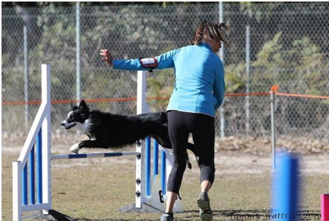
Handler 'wrapping' the dog around a jump and looking towards the next obstacle

Unfortunately, due to a looming, lurking and lashing down rain East Coast Low (ECL), our Agility Trial for the weekend of 5 th March was cancelled. The grounds were just too unsafe for athletic dogs running, weaving and jumping at speed, let alone the potential risks for handlers on wet ground.